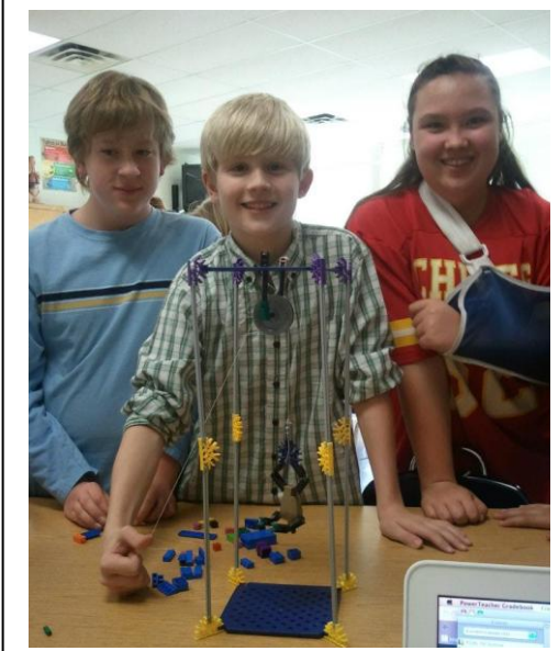
Simple Machines Project One of many new engaging projects at SJHS